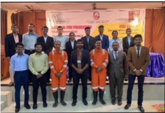
ONGC faculties flanked by Student chapter office bearers