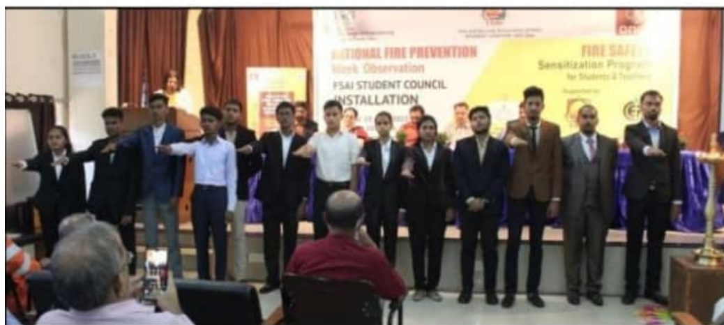
A view of the oath taking ceremony by the president elect and all other office bearers