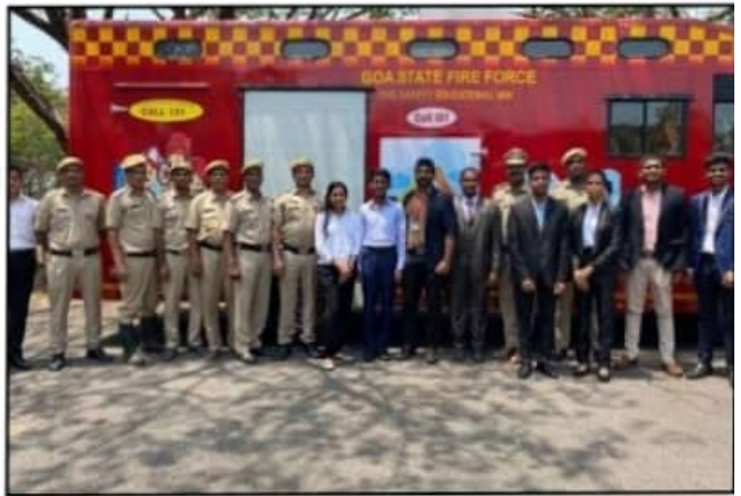
Proud teammates of the fire brigade featured along with the student chapter group With a 'picture – perfect' backdrop of the coveted Fire Safety Education Van