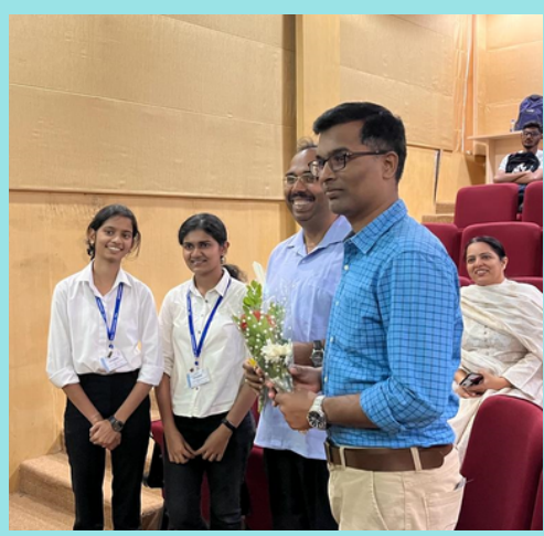
Floral welcome of the speakers by students